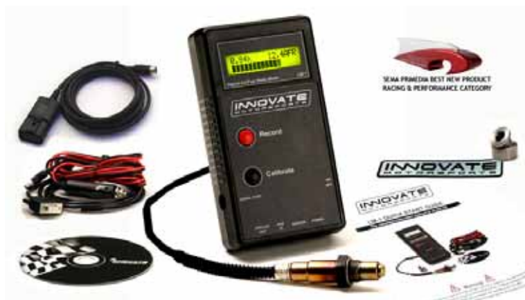
Innovate LM1 gas analyser