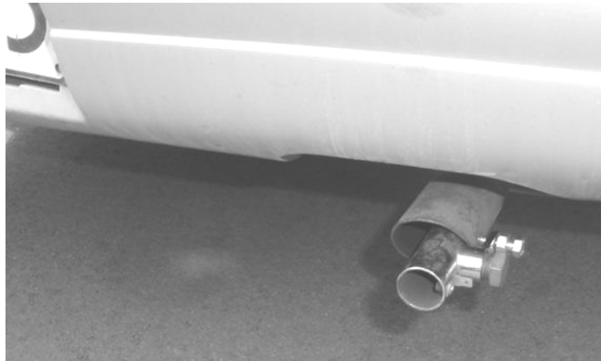
Tail-pipe adaptor kit mounted into exhaust tail-pipe