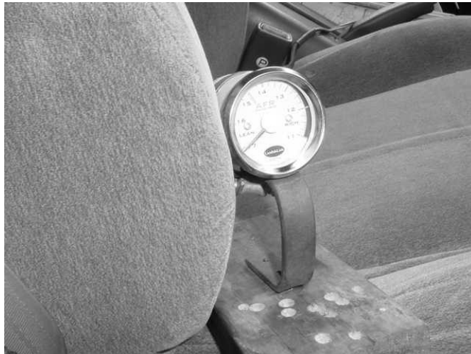
LambdaLink gauge on temporary mount inside vehicle