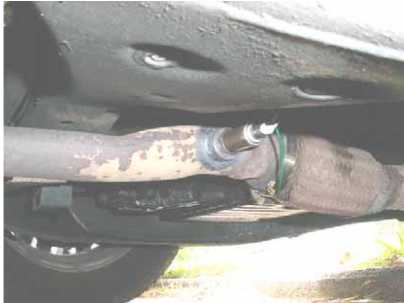
Oxygen sensor installed into welded socket in front pipe