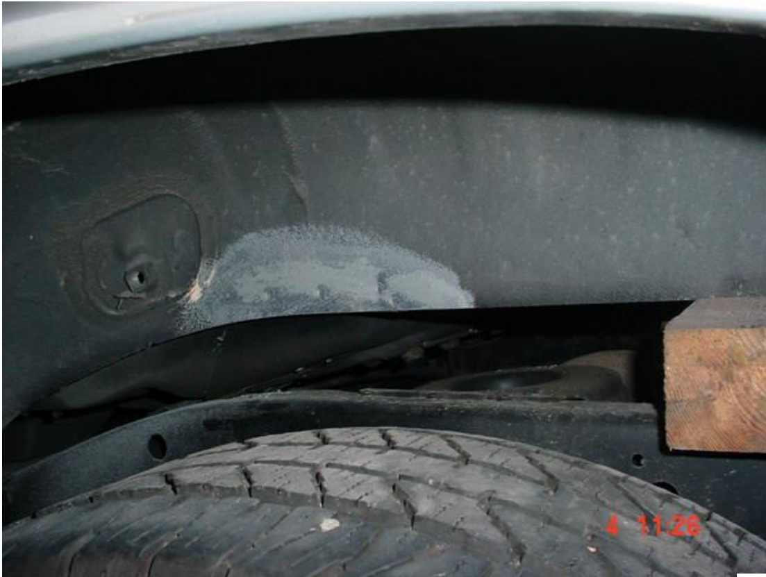
Wheel-arch spot welds are exposed by wire-wheel brushing back to bare metal.