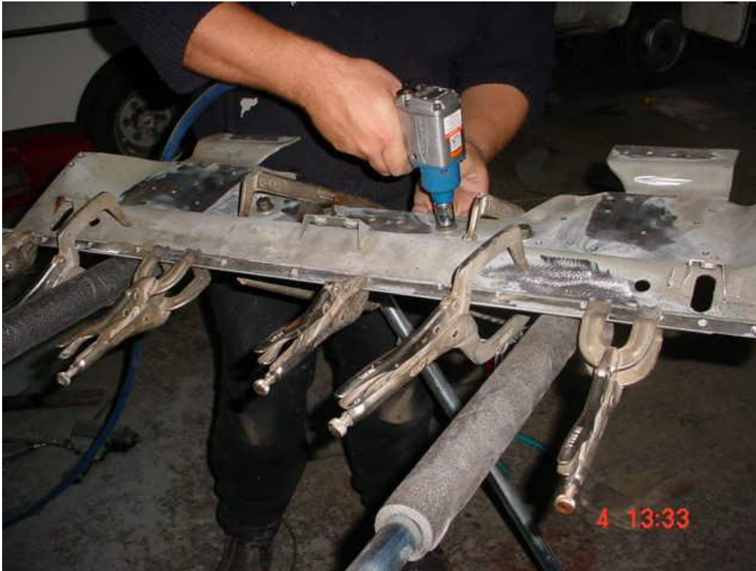
Seatbelt bolts through the seatbelt-anchorage plates help clamp the assembly for welding. N