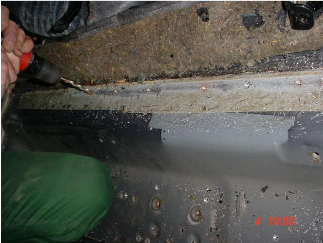
Interior of vehicle floor, spot-welds drilled 8.5 mm through the central floor section only, (1 layer), ready for later plug-welding.