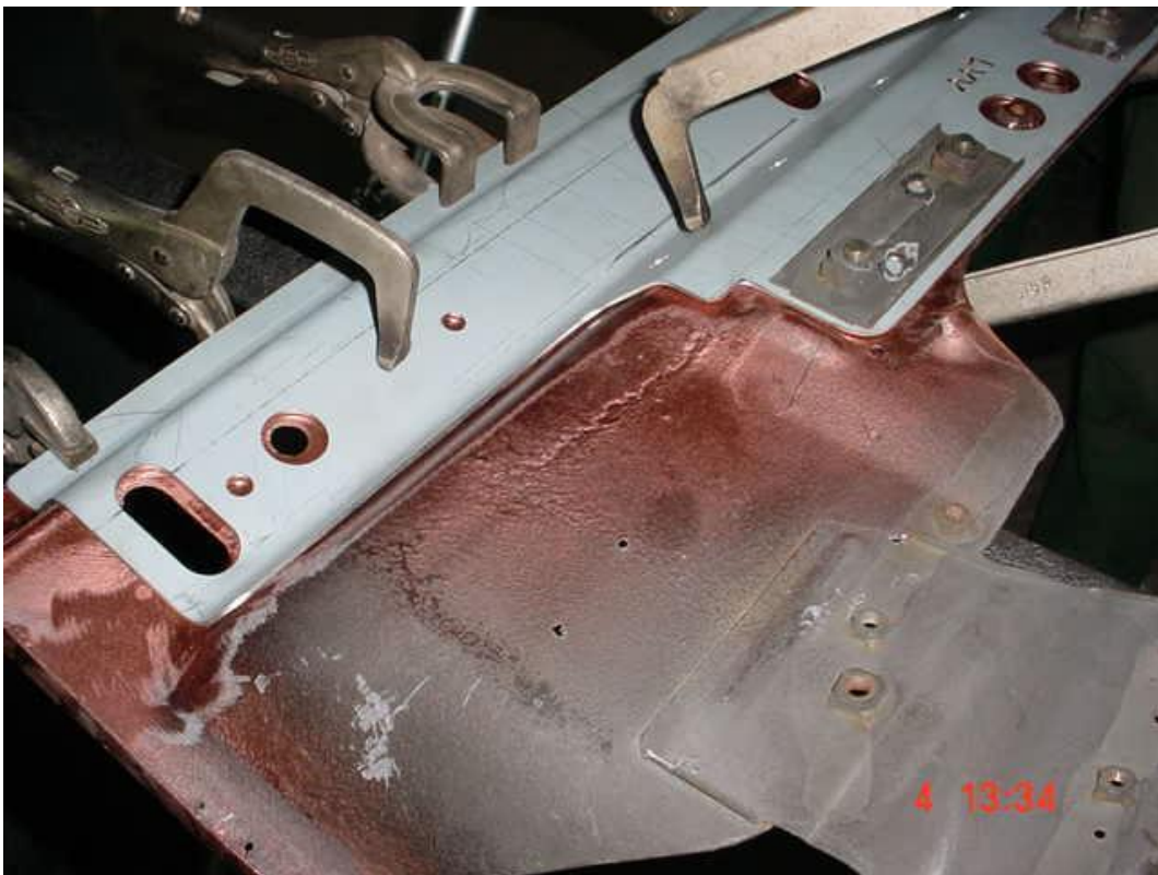
LVV load-bar and seatbelt anchorages ready to be plug-welded. O