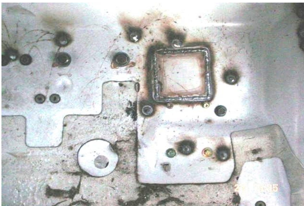
An example of a patch-weld in the central floor area of another vehicle, ready to clean up and coat with automotive epoxy primer.