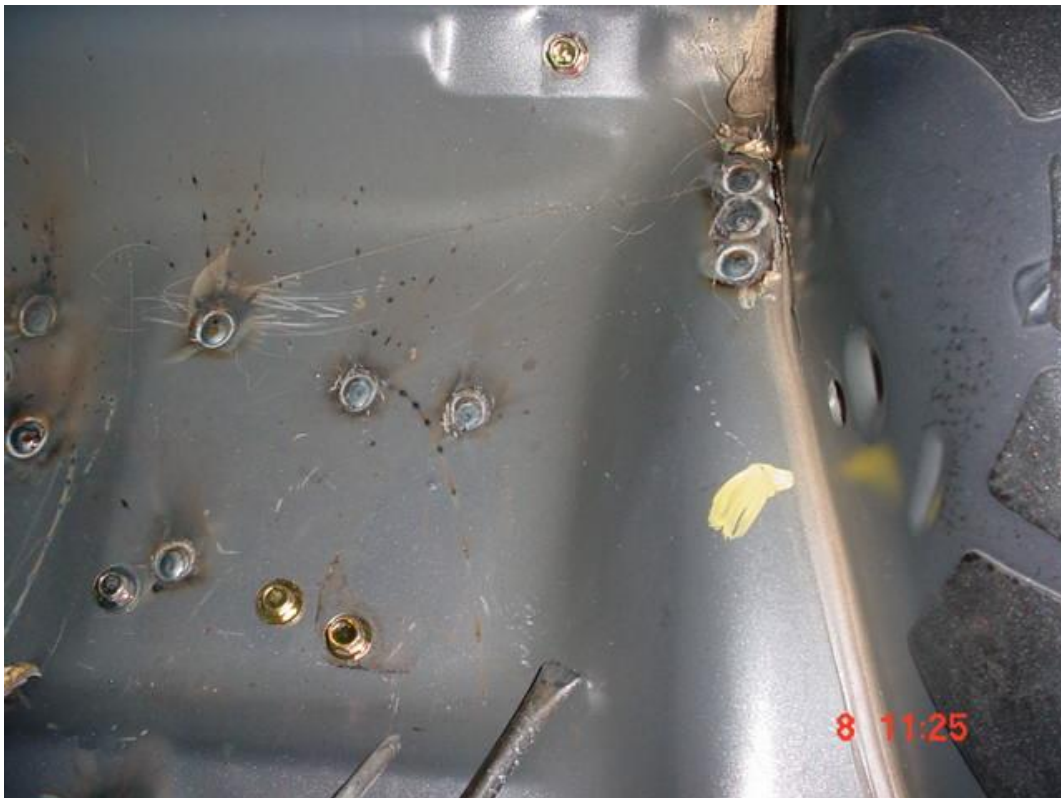
Plug-welds in the central floor area have been welded, ready to grind flush.