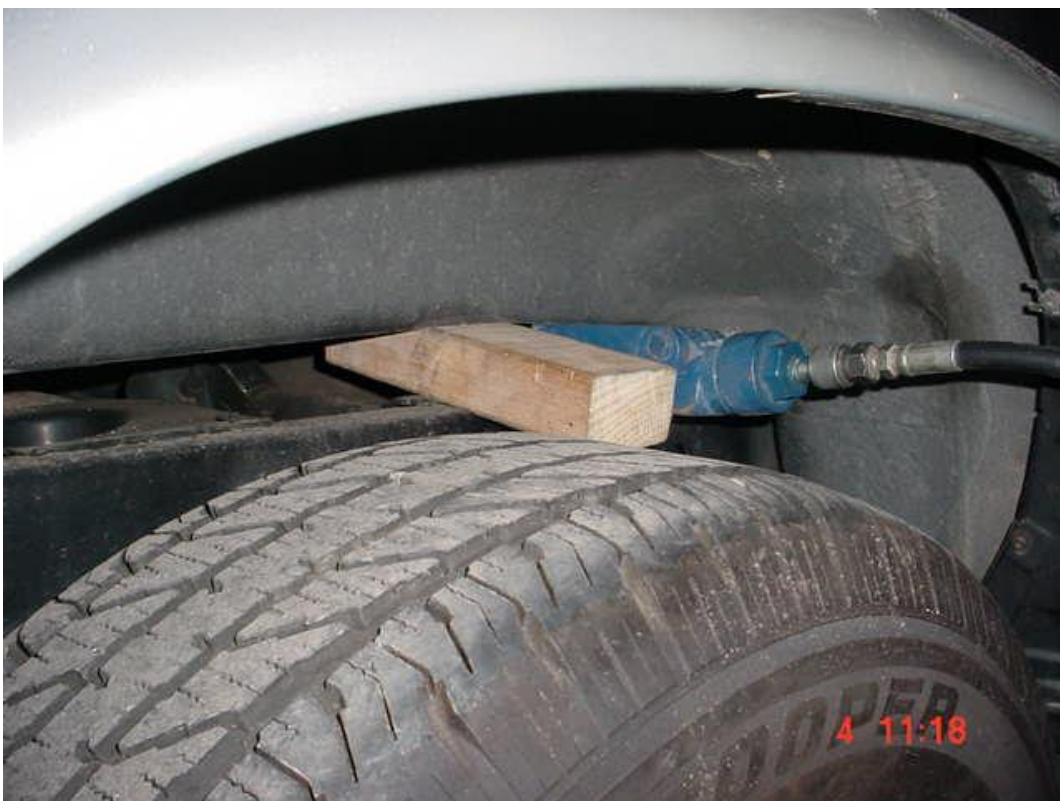
The body is lifted away from the rear end of the chassis and supported by approximately 100mm solid blocks.