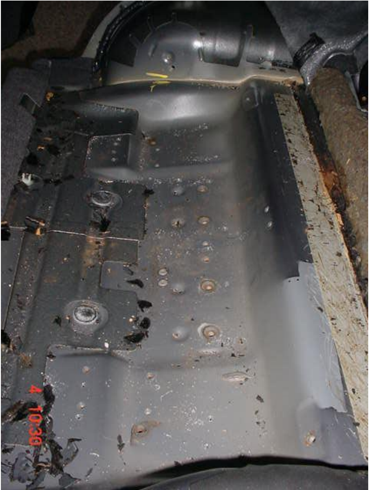
Terrano floor, inside vehicle, with seat removed, photo taken from left rear door opening, very little visible rust was showing in the interior of this vehicle.