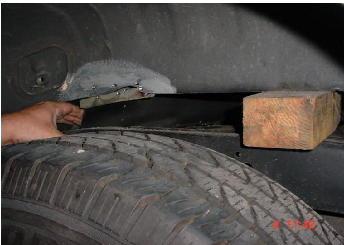
After drilling out the 4 wheel-arch spot-welds, a check is made by levering to ensure that all other spot-welds have been drilled out, to allow reinforcing plate to be easily removed.